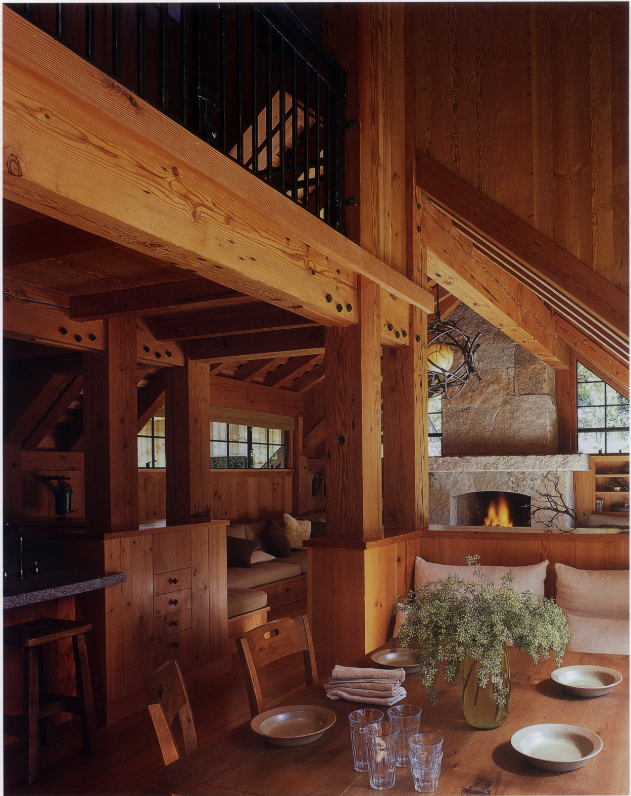
above: The house's Shaker-like simplicity is most evident in the dining room, which sits beneath a sleeping loft. Antique French hemp covers the banquette's cushions and pillows, while the dishes are from Heath Ceramics. The table and chairs were made from reclaimed white-oak barn beams and rafters. opposite: The dining room's window wall provides uninterrupted views of an eight-thousand-foot peak nearby.