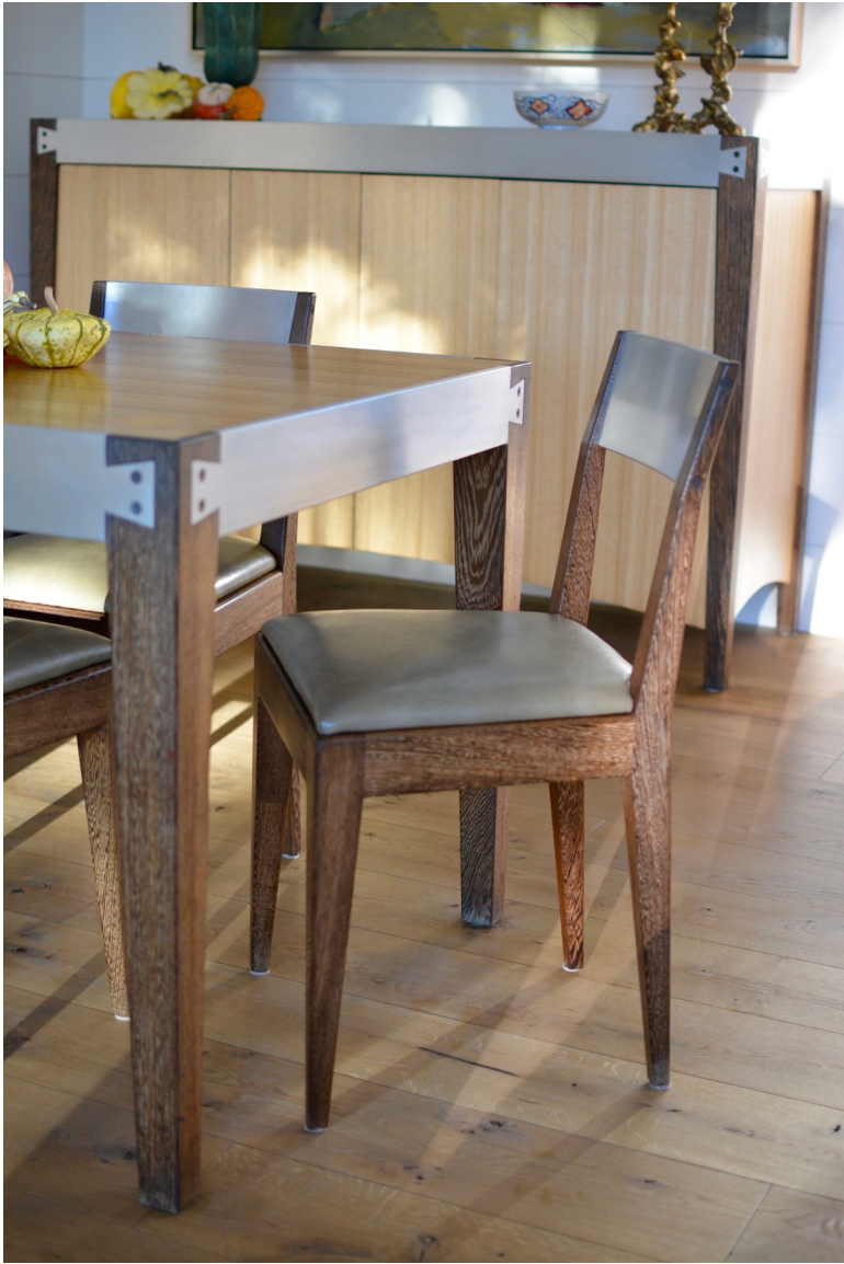
CHAIRS IN WENGE, ALUMINUM AND LEATHER