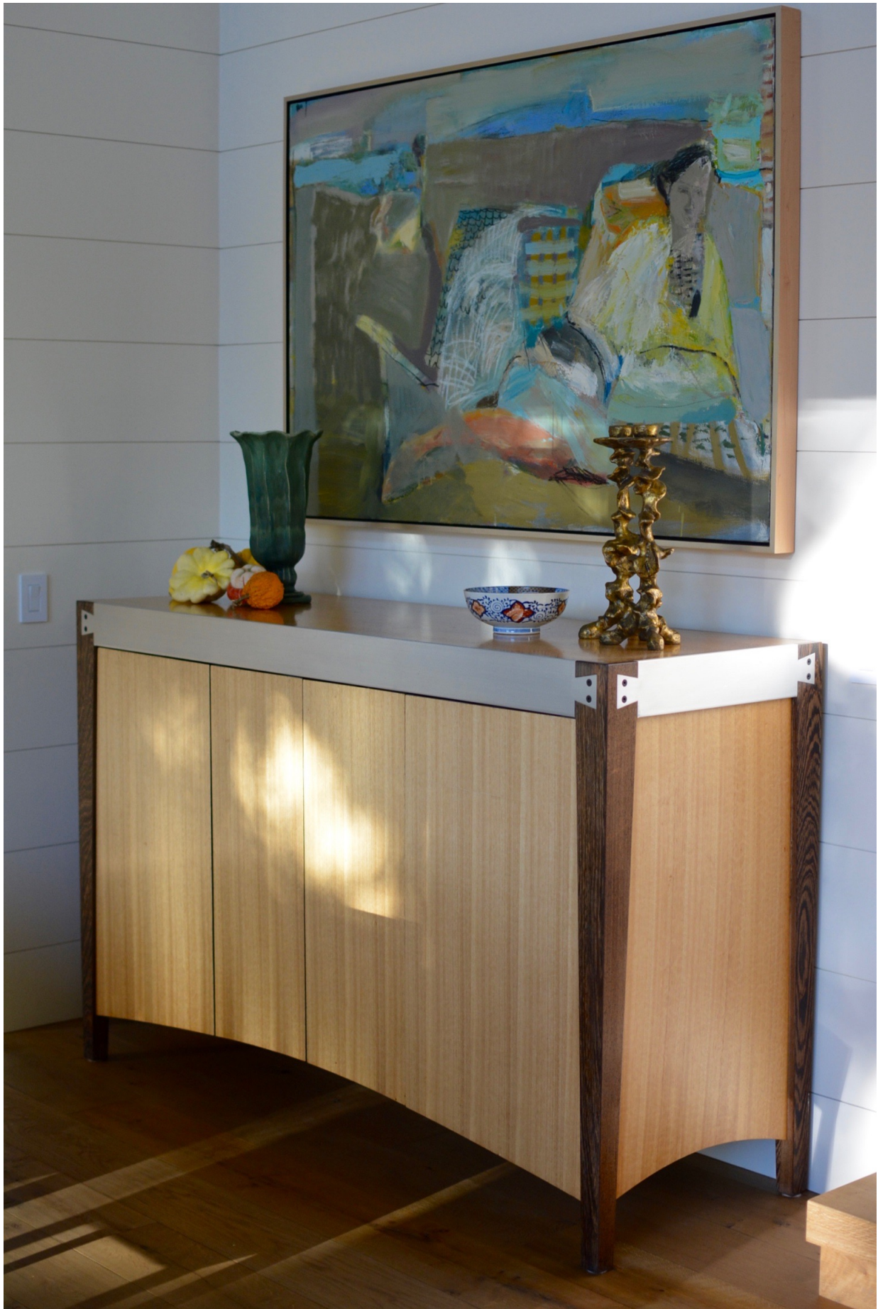
SIDEBOARD IN WENGE, ALUMINUM & BLONDE SNAKEWOOD VENEER