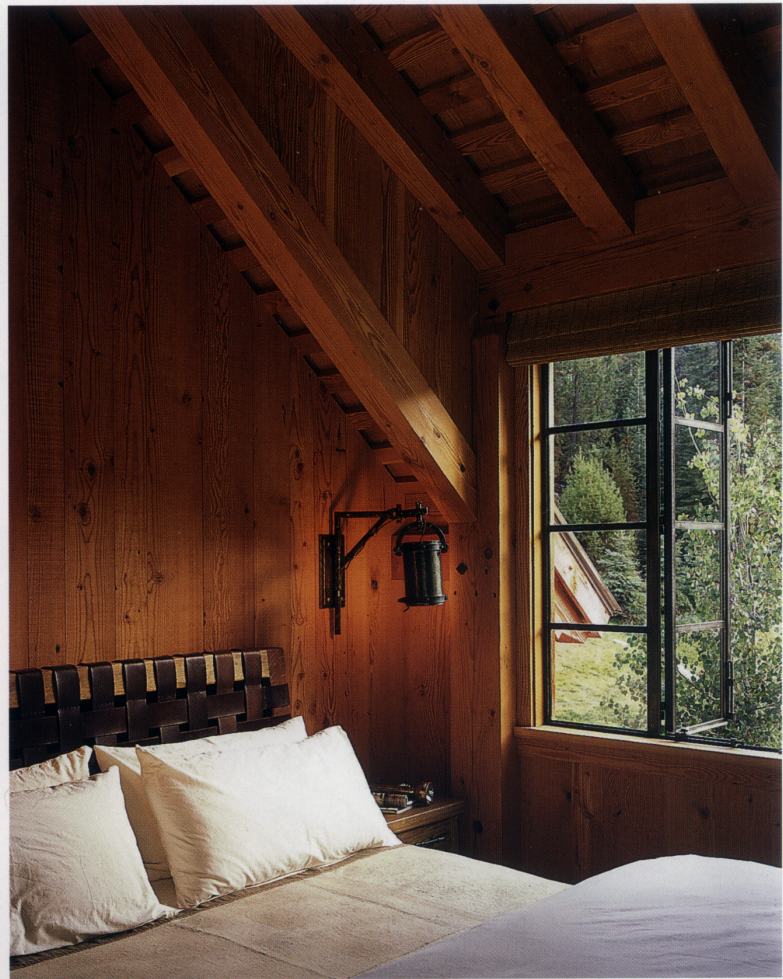
top left and left: "We kept the master bath small and efficient," says Walker. The tub and sink were carved from granite. The faucets and towel ring are from Rocky Mountain Hardware. above: Sconces in the master bedroom "evoke old lanterns that were carried by miners," says Walker. opposite: Steel doors and windows prevent bears from gaining access during winter, while thick cedar siding deters woodpeckers. Standing-seam metal roofs mimic the granite slopes surrounding the house.

from Provence was used to cover seat cushions in the dining room, and textured lambswool and cotton blends were sewn up as cushion and pillow covers in the living room. Larger cushions double as mattresses when the house is full of children.