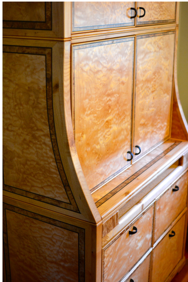
“FLIPPER” DOORS ON CENTER COMPUTER SECTION. KEYBOARD ROLL OUT, DRAWERS BELOW AND SHELVING ABOVE.