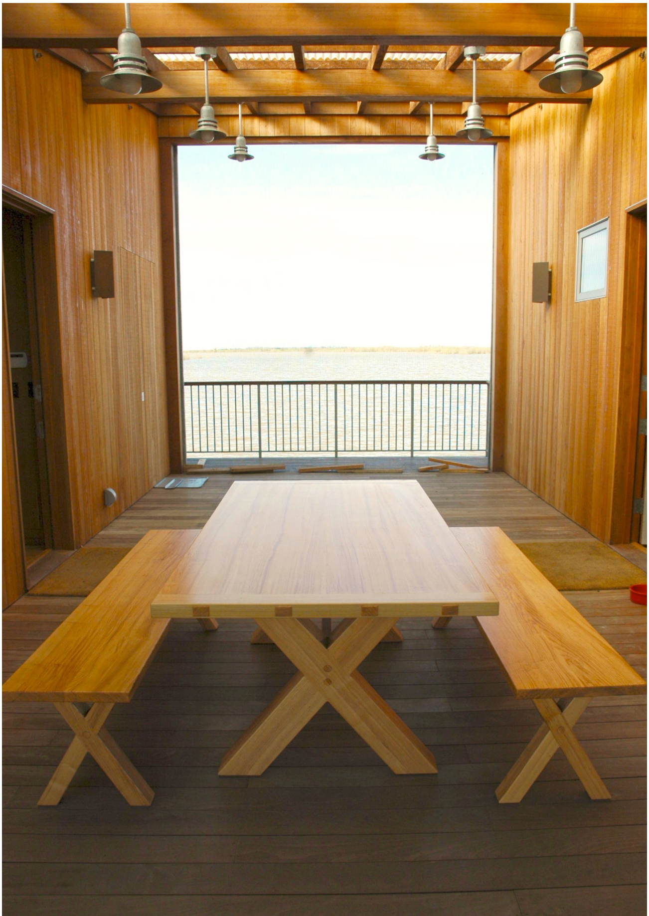
HUNTING LODGE BREEZEWAY TABLE