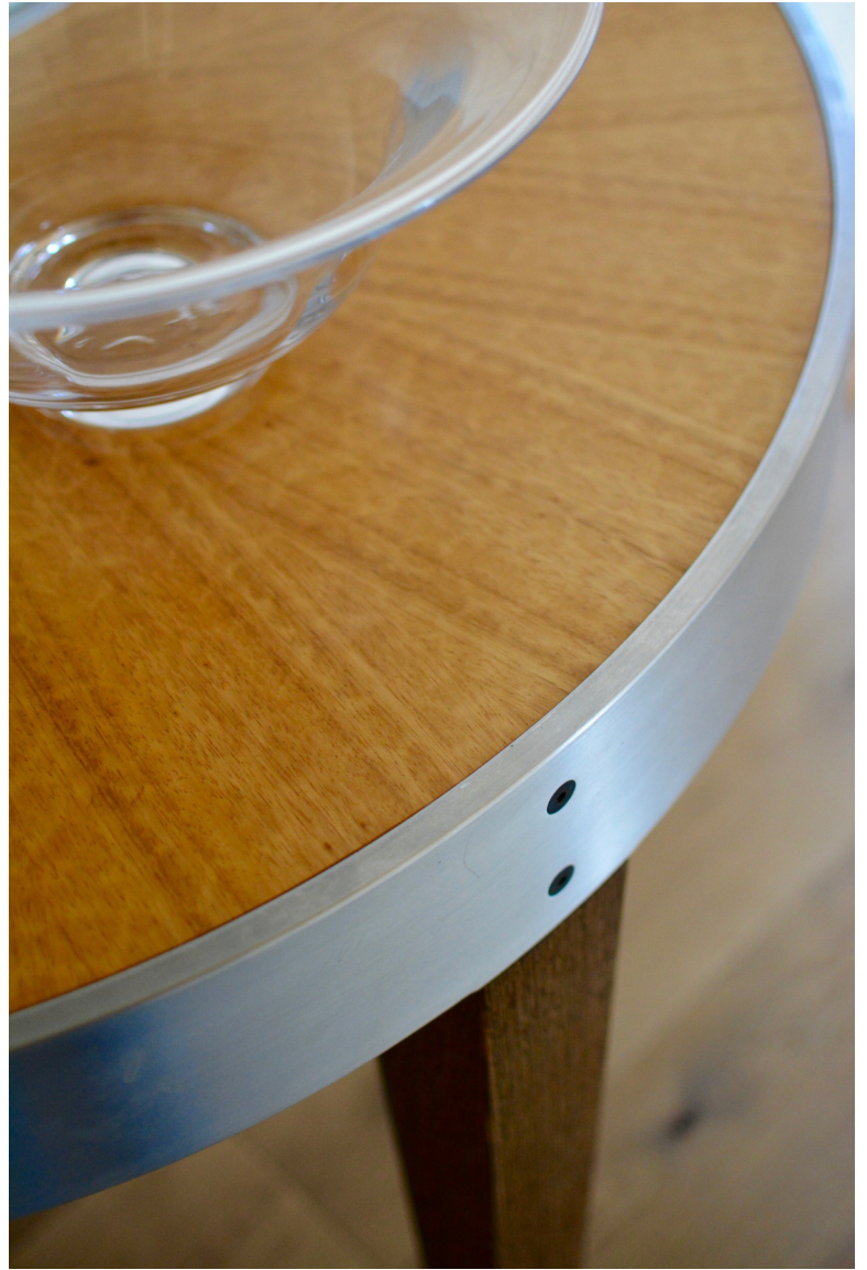
DEMI-LUNE SIDE TABLE DETAIL